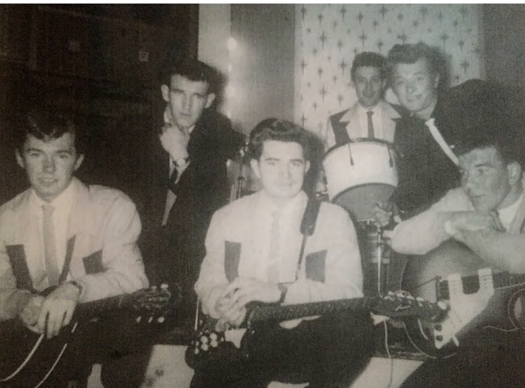
The Dynatones yn nhafn y Navigation yn Aberfan.